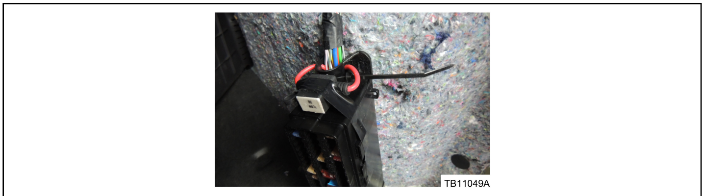
Figure 3 - Article 17-0032