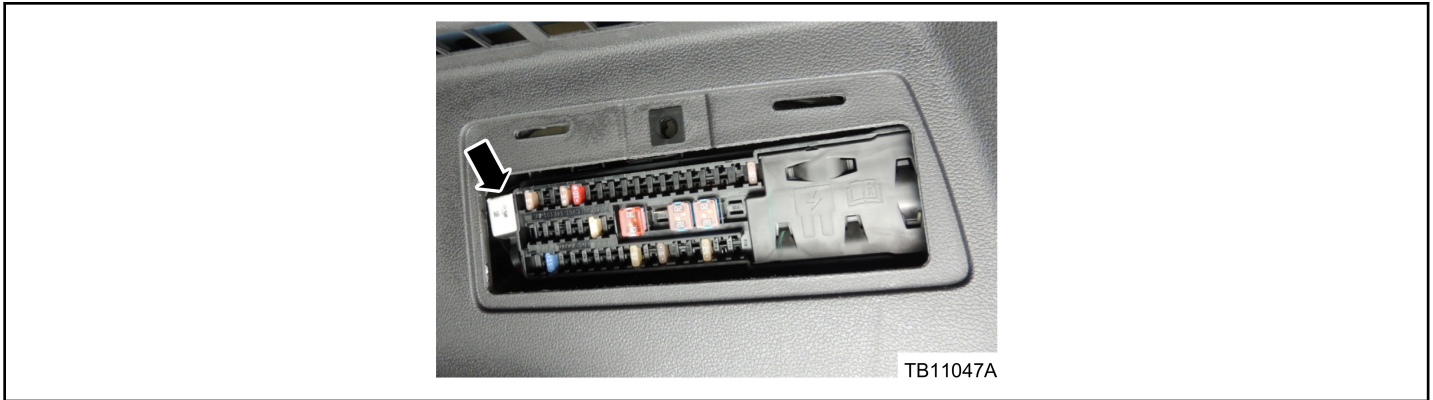
Figure 4 - Article 17-0032