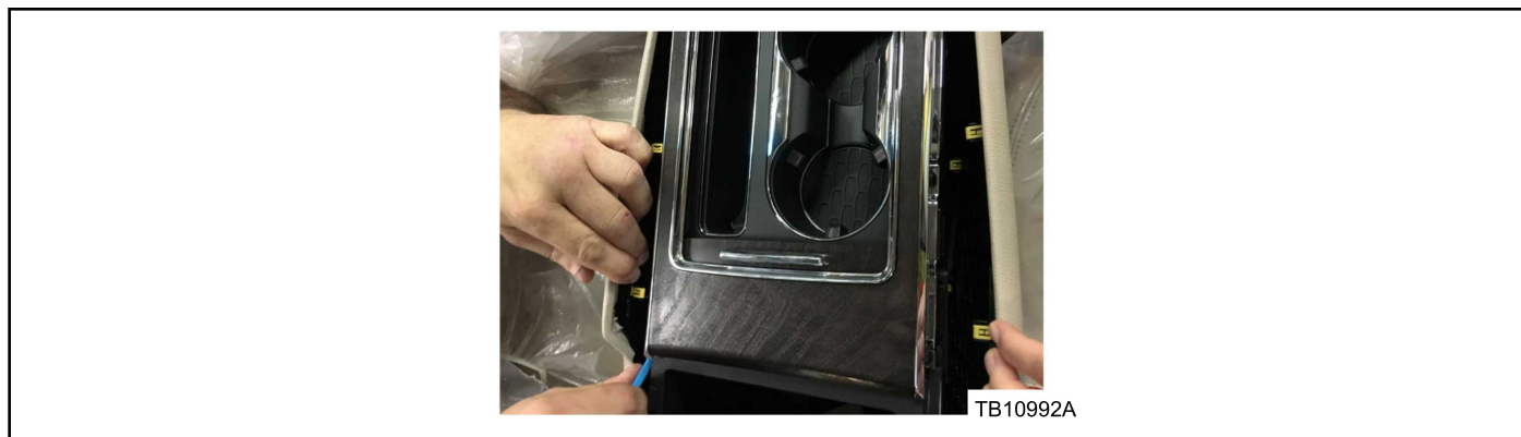
Figure 1 - Article 16-0160