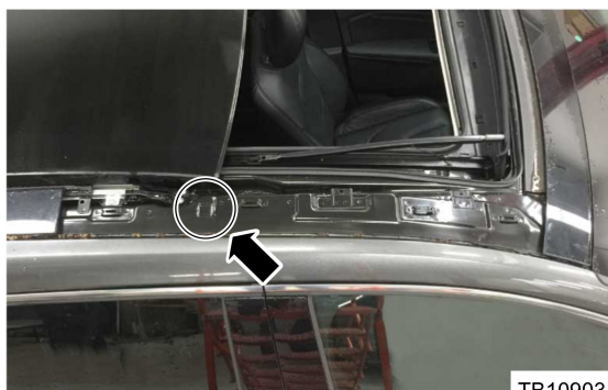
Figure 1 - Article 16-0079