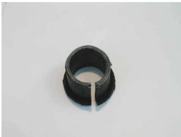
New bushing for torsion bar p/n 400511324C