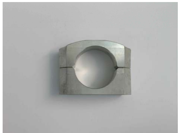
New support for torsion bar p/n 400411031D