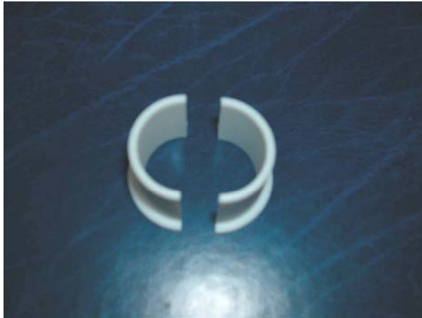
Old bushing for torsion bar p/n 400511324