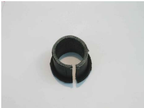
New bushing for torsion bar p/n 400511324C