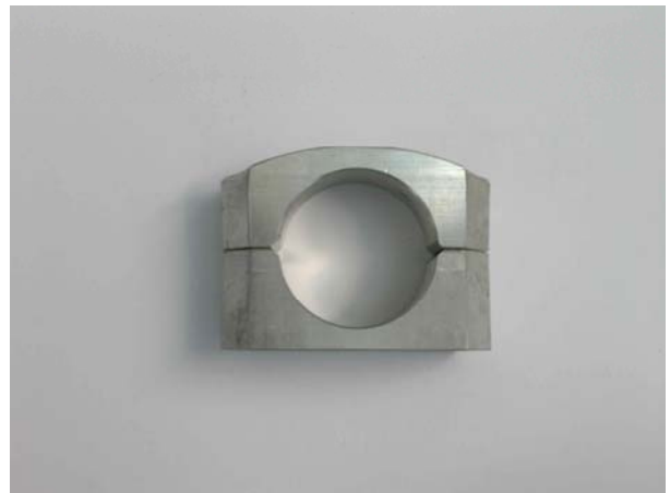
New support for torsion bar p/n 400411031D