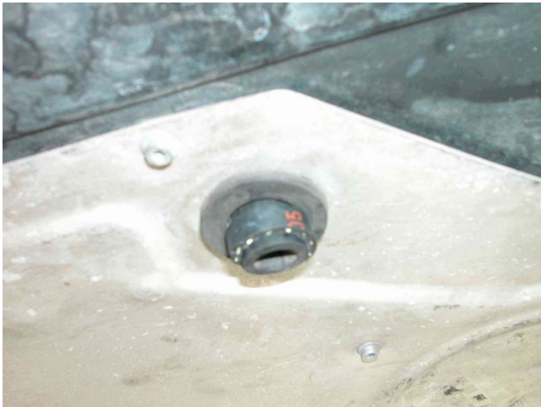
The information and procedures published below are strictly confidential and intended exclusively for authorized operators and individuals. All copyrights are the property of Automobili Lamborghini S.p.A based on copyright law. The company reserves the right to make updates and modifications. The reprinting, reproduction, forwarding to unauthorized people and/or to third parties and partial or entire translation thereof are prohibited without written authorization from Automobili Lamborghini S.p.A. Picture 5