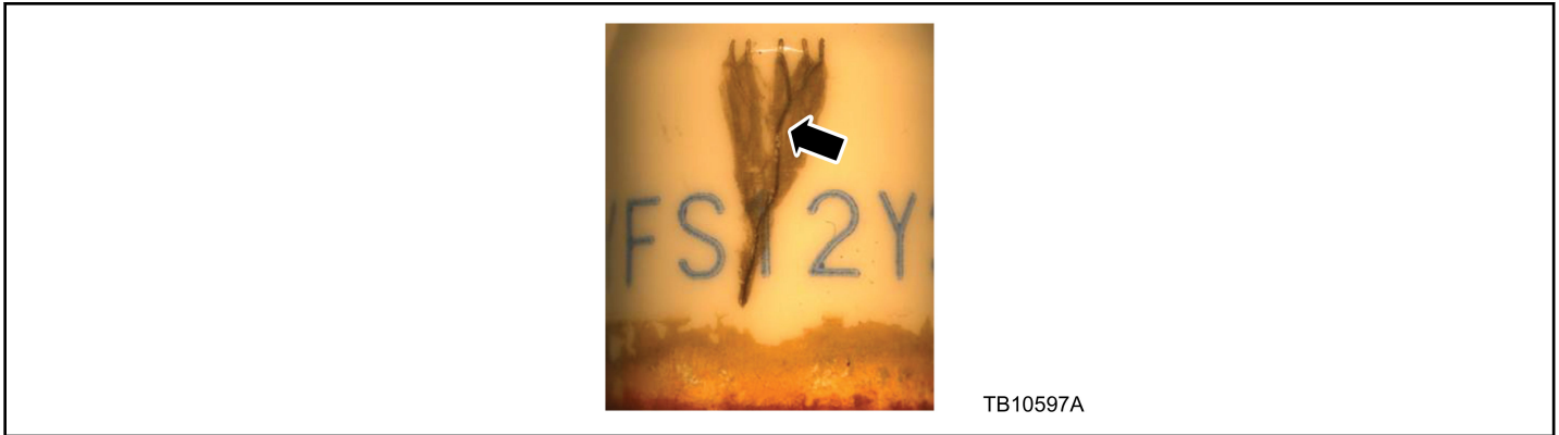
Figure 2 - Article 14-0180