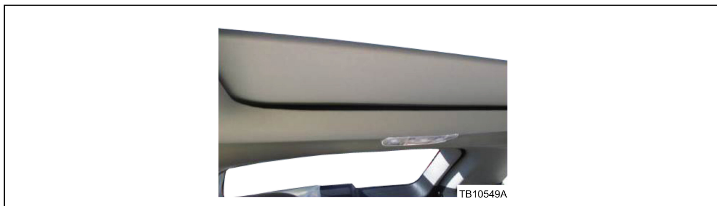
Figure 1 - Article 14-0088