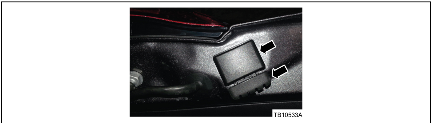
Figure 1 - Article 14-0070