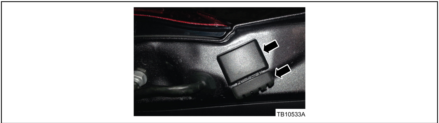
Figure 4 - Article 14-0070