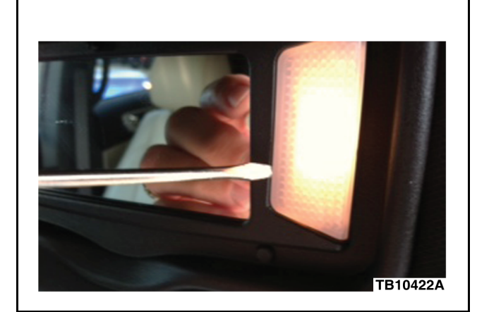
Figure 1 - Article 13-5-30

Using a small flat head screw driver, remove plastic light cover by pushing out to the right. (Figure 1)