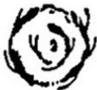
Bullseye or Halfmoon (partial Bullseye)

Examples of often-repaired windshield damage are: