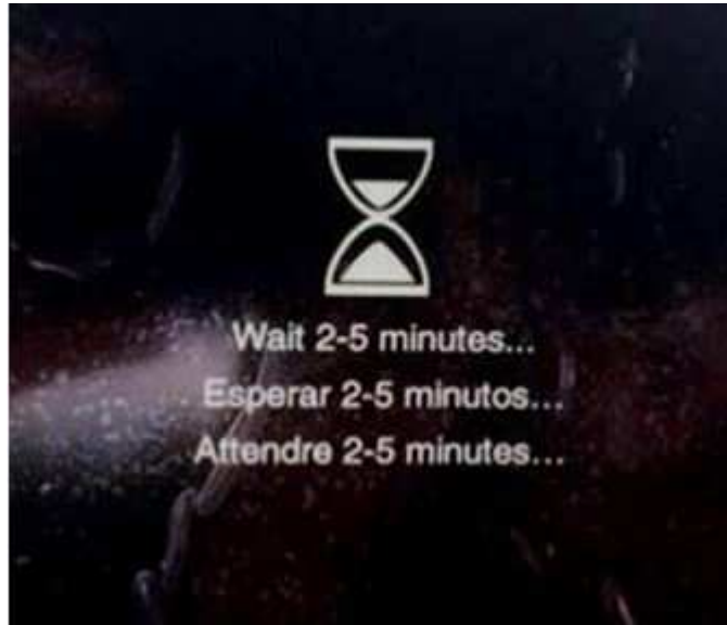
Fig. 3 **Hourglass Screen**

NOTE: **During the update process you will see multiple hourglass and “Please Insert Update USB” screens for extended periods of time (several minutes) (Fig. 3) or (Fig. 4) . DO NOT remove the USB flash drive at this time. Only remove the USB flash drive when the update has completed, when the screen displays the software levels again. The screen will say “Software updated successfully”.**