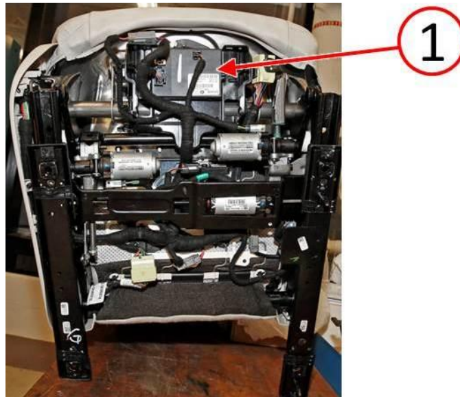
Fig. 4 CSWM Location Under Passenger Side Seat