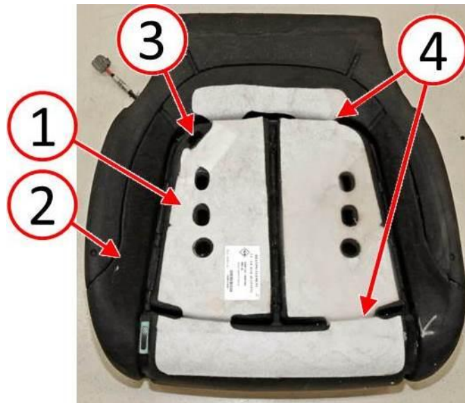
Fig. 2 Install New Heater Pad To Foam Cushion

NOTE: Ensure the heated seat pad (1) is tucked fully into the seat foam cushion channels (4) at front and back of the foam cushion and the heater pad lays flat on the foam cushion without wrinkles ( Fig. 2 ).