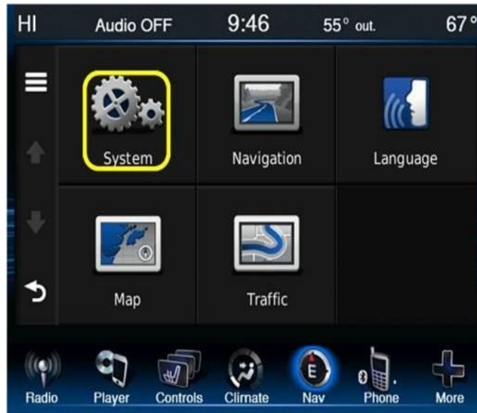
Fig. 6 System Screen Icon