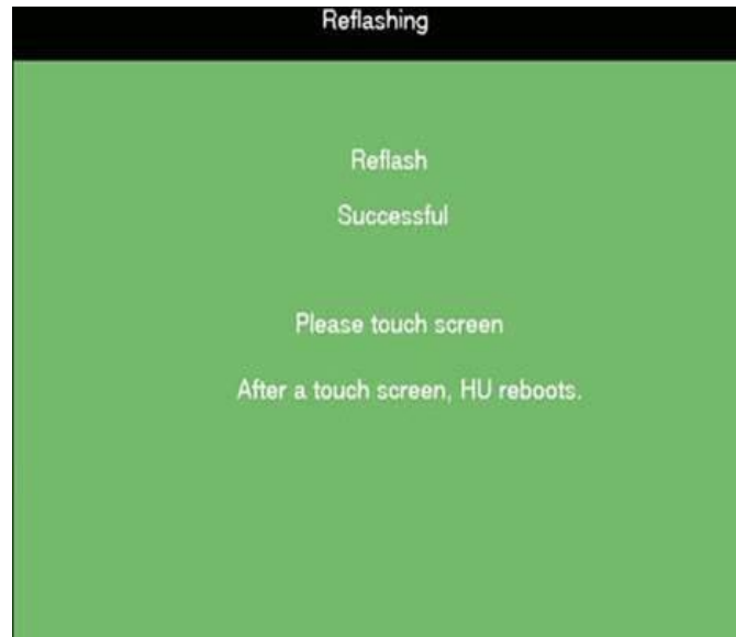
Fig. 3 Touch Screen Instruction