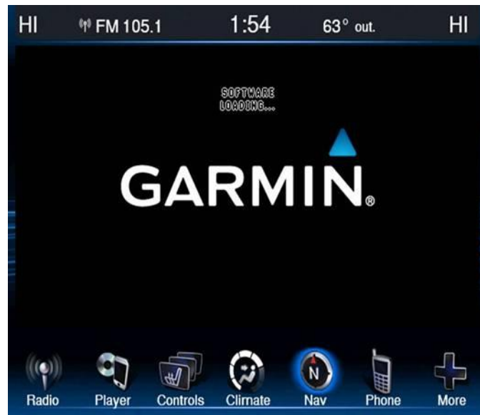
Fig. 8 Garmin Software Loading