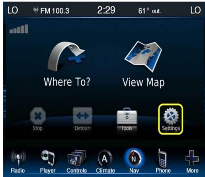
Fig. 5 Settings Screen Icon

21. Press the Settings Icon. See (Fig. 5).