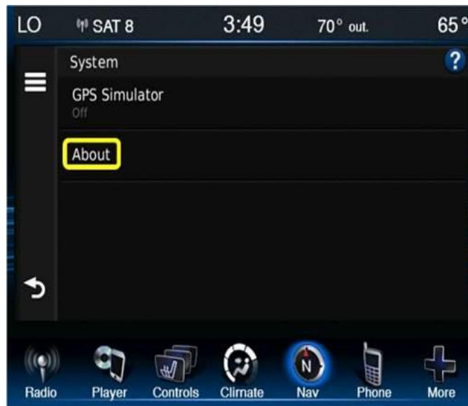
Fig. 7 About Screen Icon