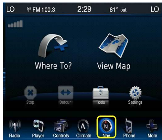
Fig. 9 Update Complete