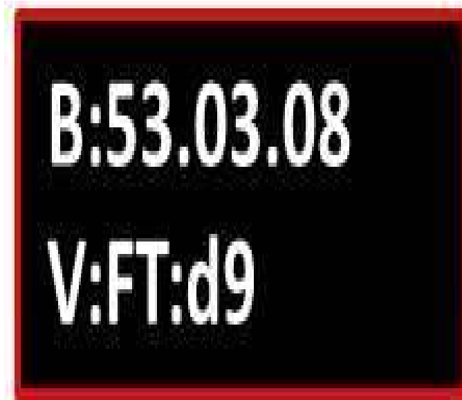
Fig. 10 Software Versions D

NOTE: **Both lines on the display should match the versions above by Sales Codes RSP or RSQ.