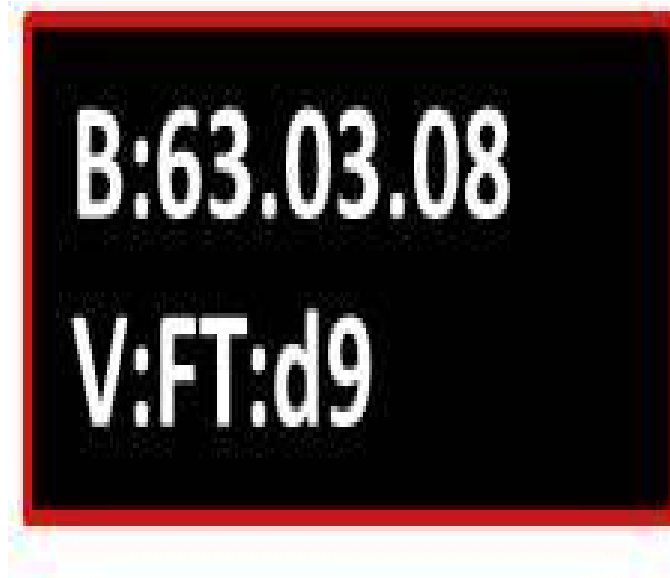
Fig. 2 Software Versions B