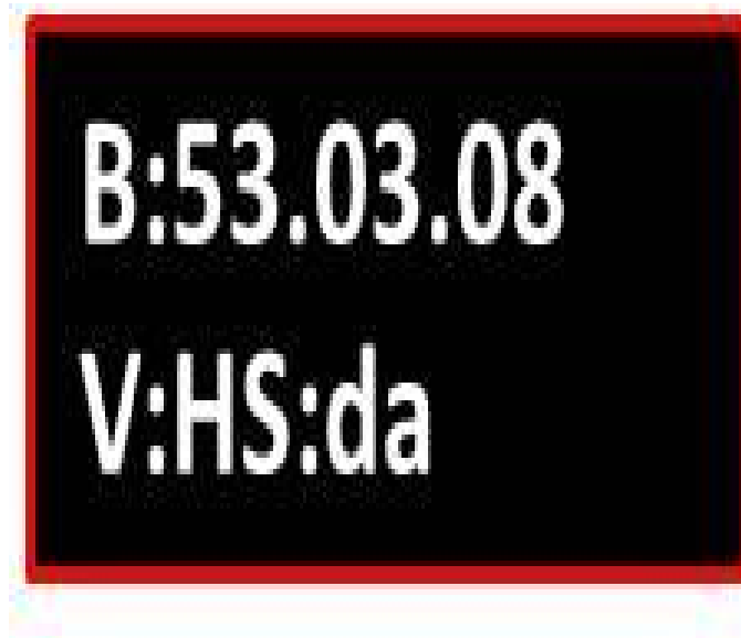
Fig. 3 Software Versions C