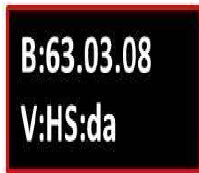
Fig. 7 Software Versions A