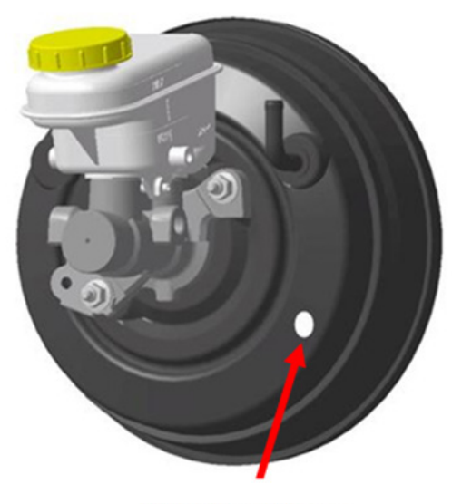
"New" part has a white dot paint mark.

NOTE: It is especially important to verify the ID of both parts on vehicles with VINs found to be within the Transition Period. Whenever unable to positively identify either component, replace BOTH as a set using the "new" part number parts.