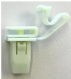
PN# D09W-68-162 ( Color: WHITE )