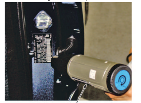
HEAT GUN OR HAIR DRYER

3. Use a heat gun and a plastic tool to remove the label. Be careful not to scratch or damage the paint.