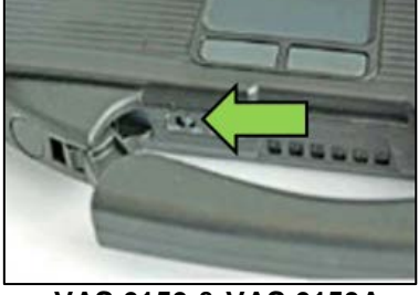
VAS 6150 & VAS 6150A (Front panel behind handle)