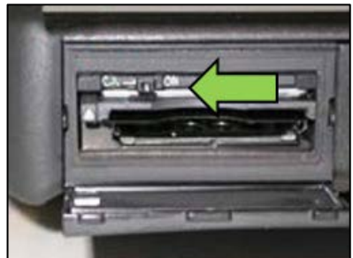
VAS 6150C (Left side behind SC/EX door)