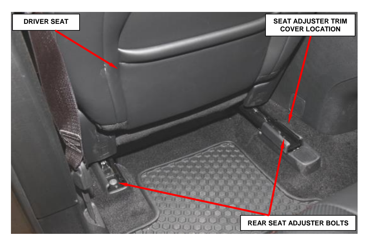
Figure 1 – Rear Seat Adjuster Bolts