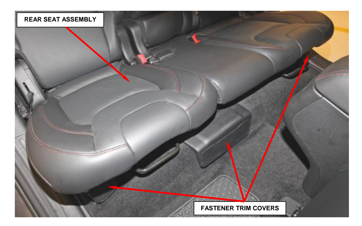
Figure 3 – Fastener Trim Covers