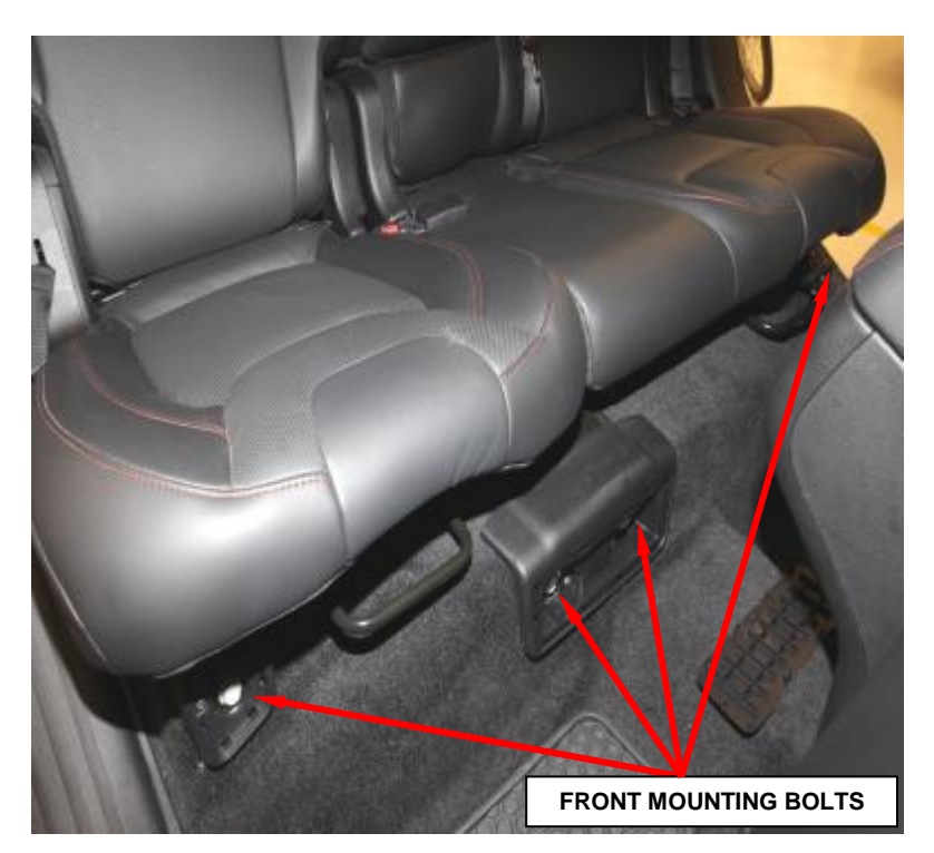
Figure 4 – Front Mounting Bolts