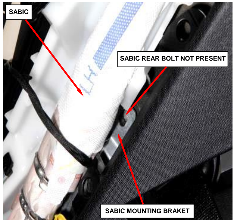
Figure 3 – SABIC Rear Bolt Not Present