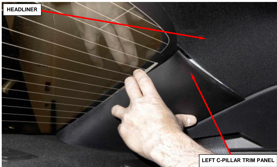
Figure 1 – Left C-Pillar Trim Panel