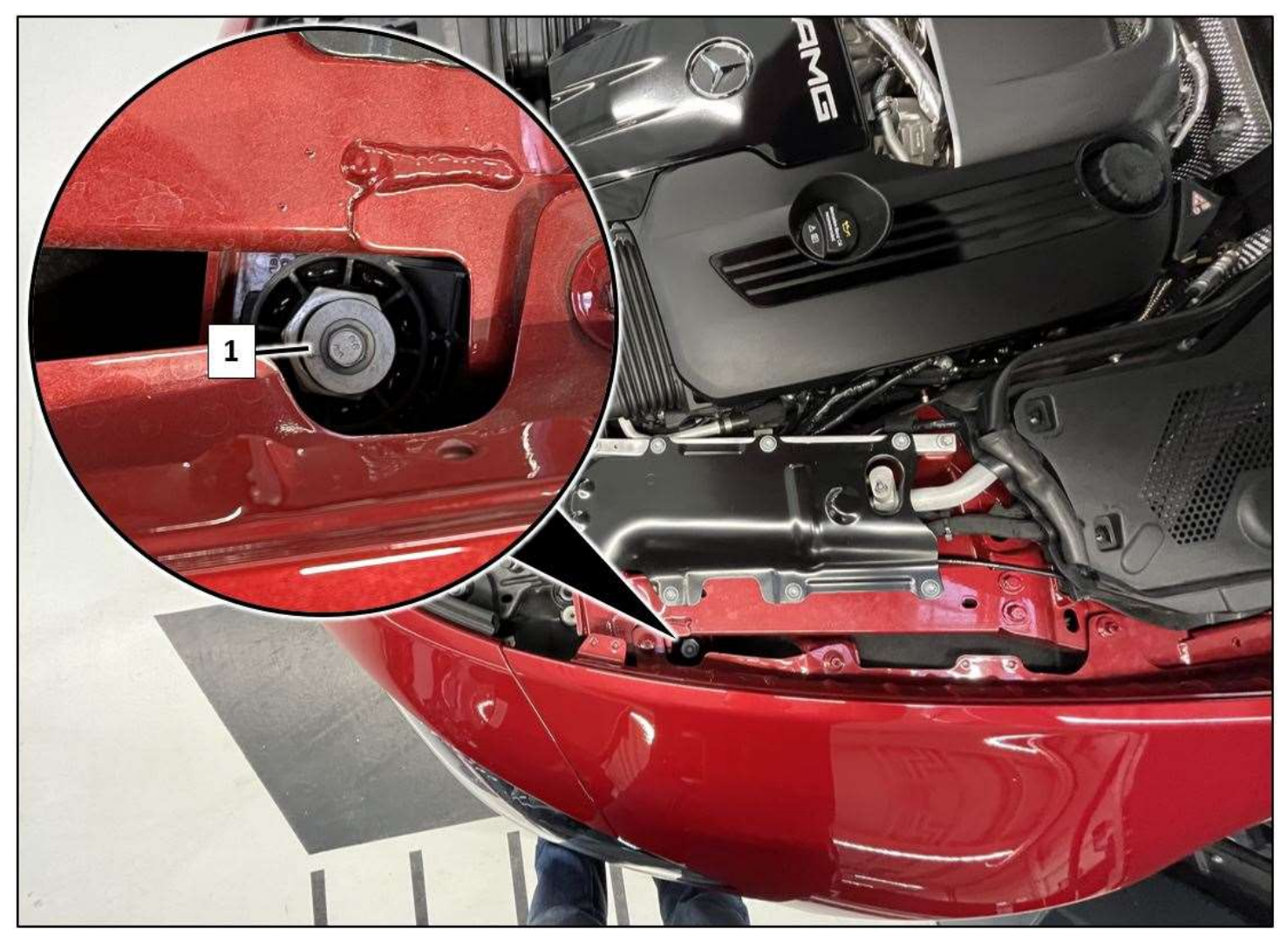
Figure 1: Washer on left headlamp shown

i The bonding area on the washer (1, Figure 1) must be completely free of dust and grease. There may otherwise be problems with adhesion.