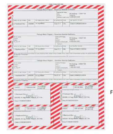
FedEx Ground Shipping Label

OP 900PRP Hazardous Materials Certification Form