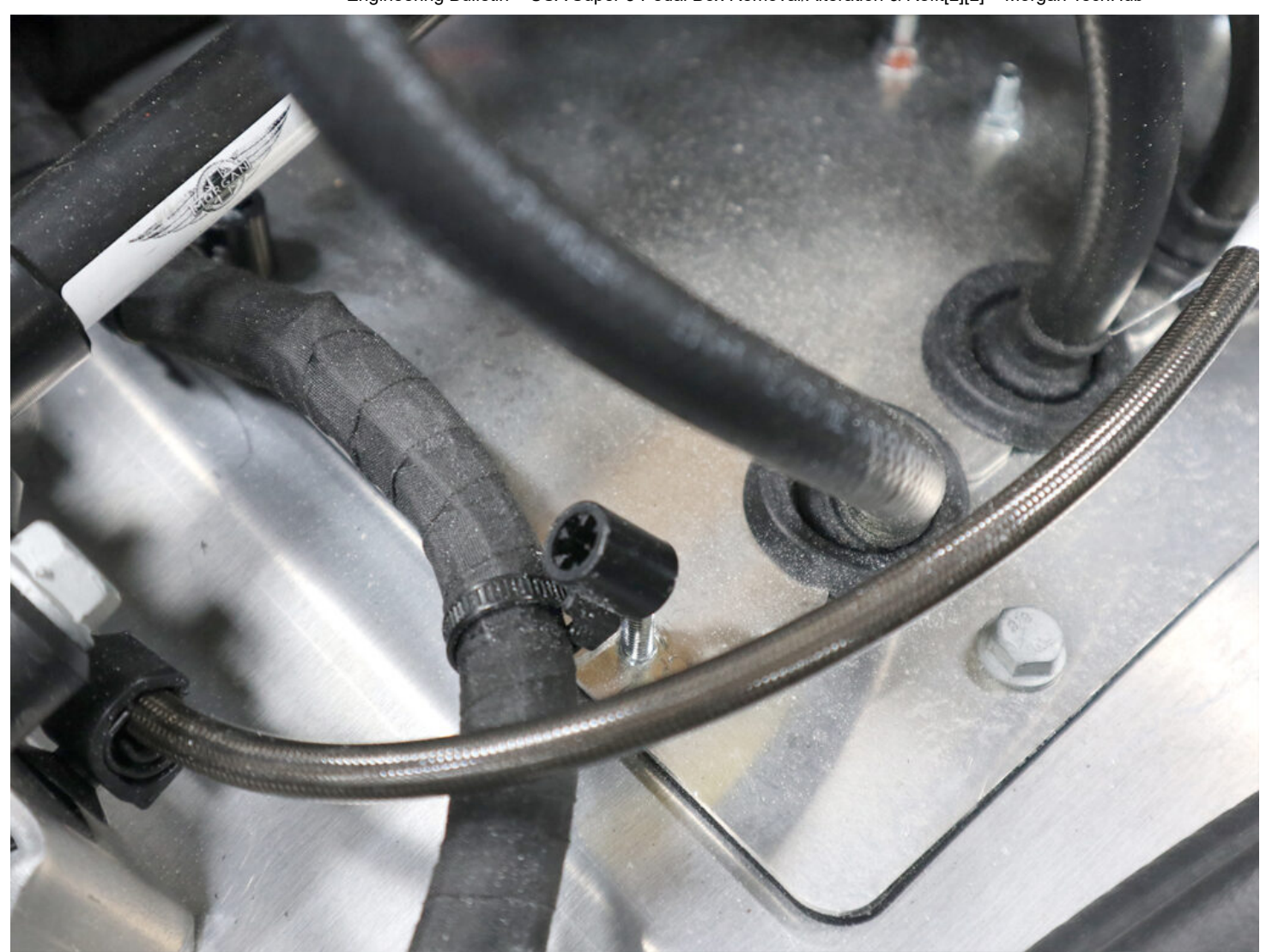
• Using a trim tool (shown opposite) or similar, to very carefully lift up and remove the cable tie push fit clips (x2) to release the wiring harness to the bulkhead closing plate.