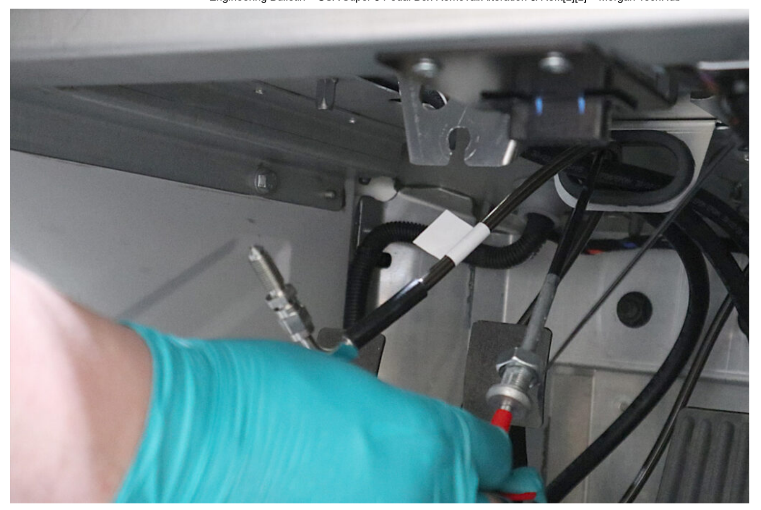
• Use a 19mm spanner to remove the pedal box position adjustment cable.