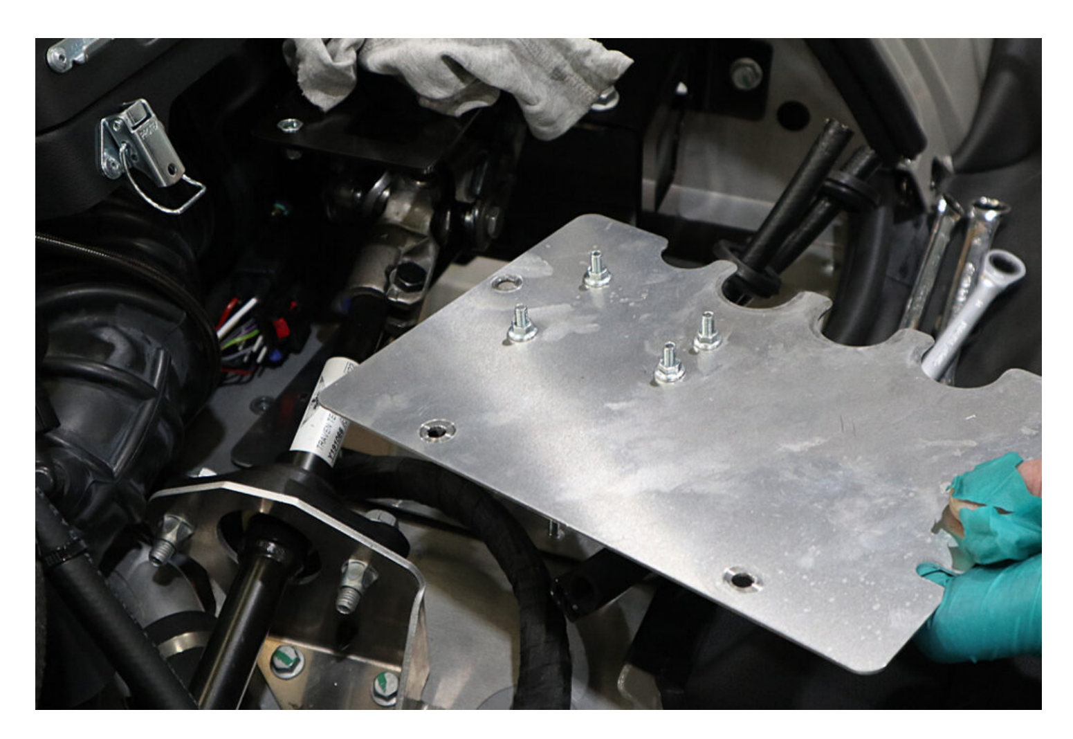
• Use a 10mm socket and ratchet to remove the remaining bolts to fully remove the pedal box closing plate.