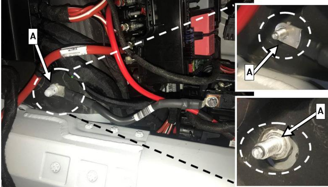
Figure 2, shown on vehicles without code ME 10 (Hybrid vehicle (plug-in, PHEV)

i For vehicles with code ME 10 (Hybrid vehicle (plug-in, PHEV), the ground line runs from the windshield heater control unit to the ground point (A, Figure 3) .