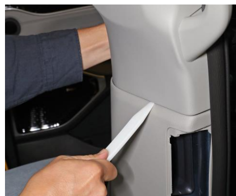
Figure 4 – Center B-Pillar Trim