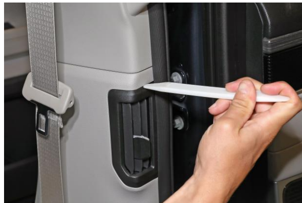
Figure 2 – B-Pillar Air Outlet