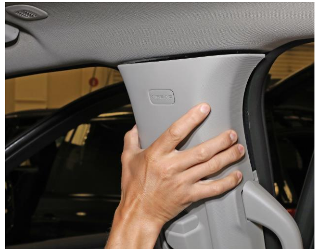
Figure 1 – Check Upper B-Pillar Trim Fit