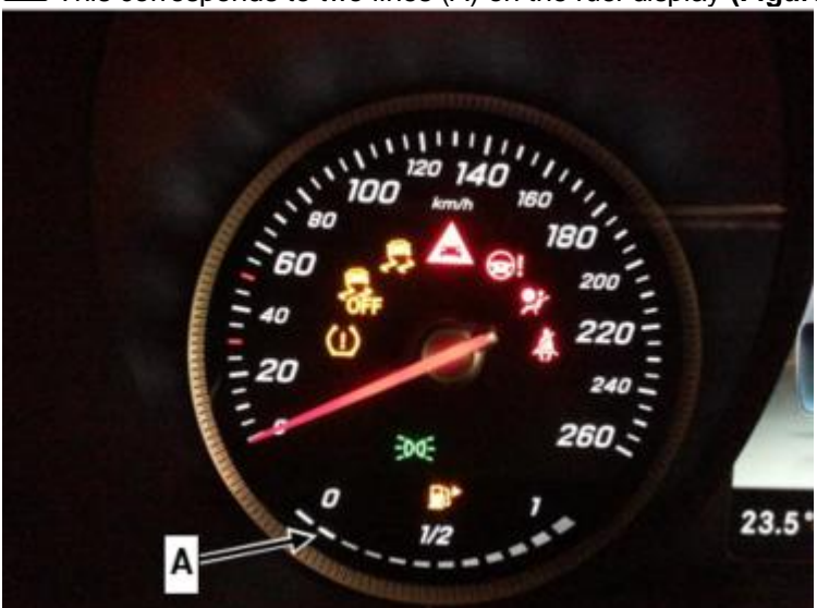
Figure 1 (shown on model 205)