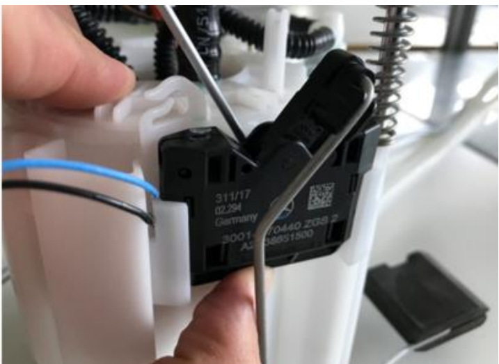
Figure 4 (using a screwdriver, carefully push float-and-lever sensor housing away from module housing and at the same time push float-and-lever sensor housing upwards.)