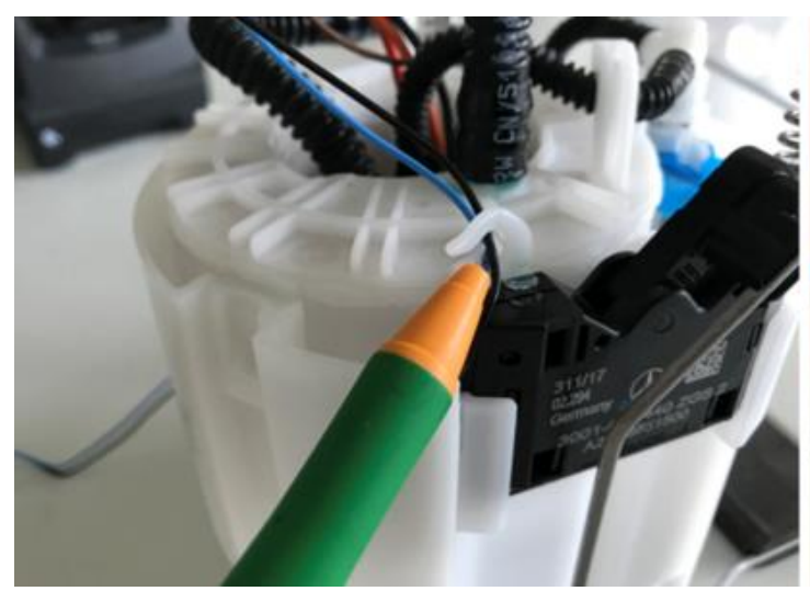
Figure 3 (remove lines from routing clip)