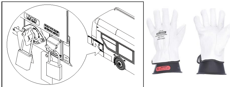
Figure 1: HV and LV Disconnect Switch Location and Arc Flash Glove Reference

🔧 NOTE: Use commercially available lock out equipment and tags being sure to follow any local laws or workplace procedures.