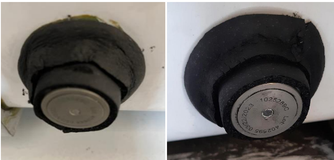
Figure 3: ESS Drains Insulated with 8” Strips of Armacell R-1 Foam Tape

WARNING: Avoid covering the piston when applying the foam tape!!! Tape is difficult to adjust once bonded!!!