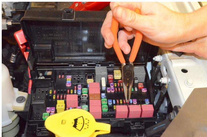
Figure 4 – Remove Fuse 83