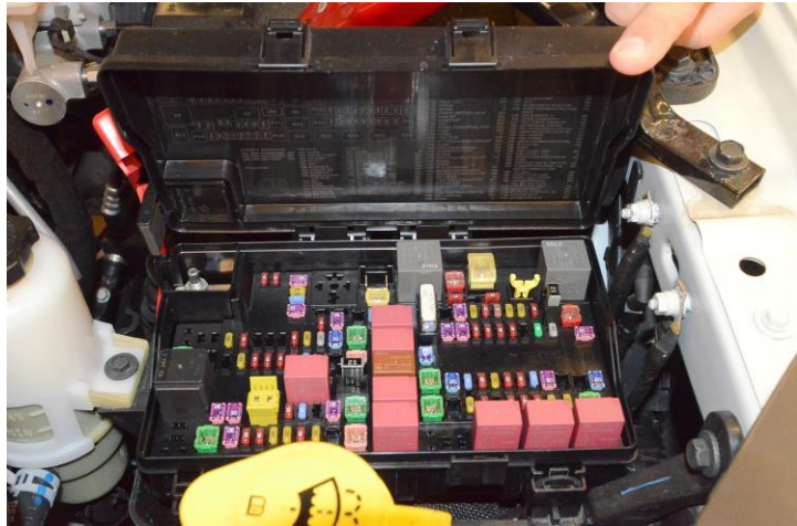
Figure 3 – Under Hood PDC