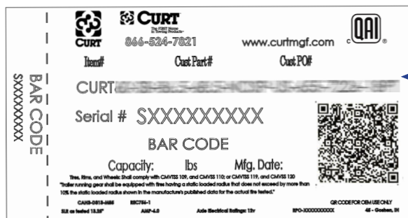
Axle Tag Sample (Not an exact replica)

A clear photo of the axle tag, including the axle serial number, must be submitted once inspection or repair is completed.