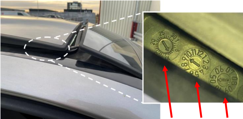
Figure 1 (The manufacturing date in the sample picture is 08 day / 10 month / 5 year) (10/08/2005)

i Vehicles with a registration date that does not match with the manufacturing date of the panoramic sliding sunroof can also be affected.