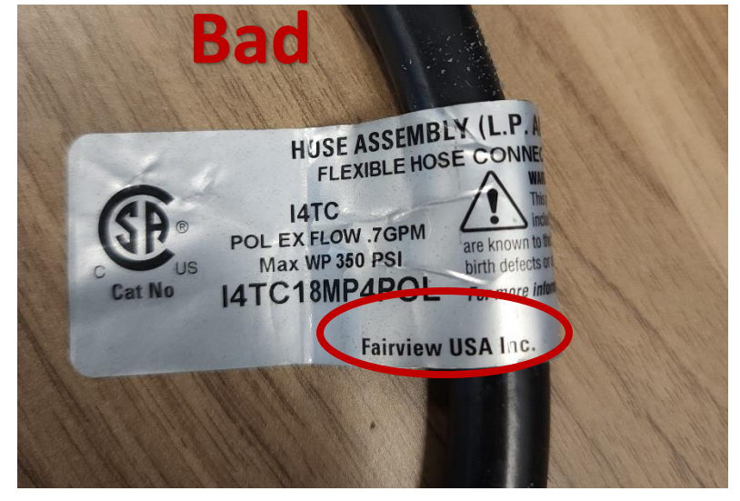
Secondary picture of the gas lines for reference (Figure 6 & Figure 7)