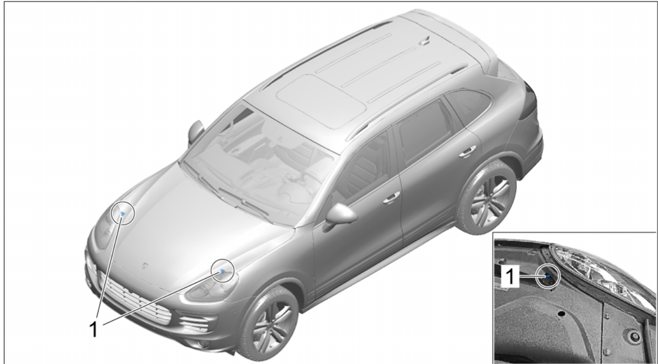
Installation position of caps (e.g. Cayenne MY 2016)