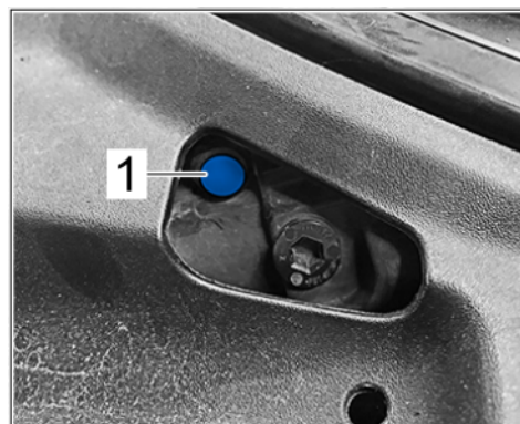
Installing locking cap (e.g. left headlight)