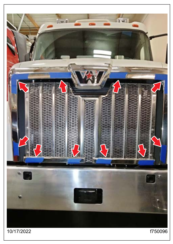
Fig. 1, Masking Tape Locations