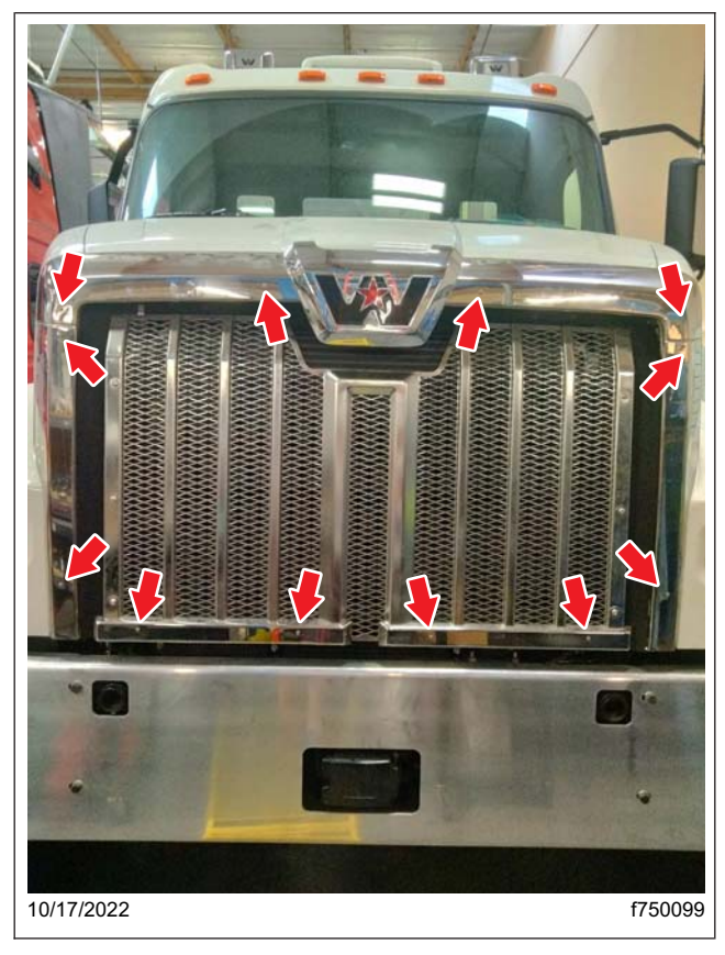
Fig. 4, Rivet Locations

11. Install the rivets into each drilled hole. Figure 4 shows the rivets installed on the hood bezels.