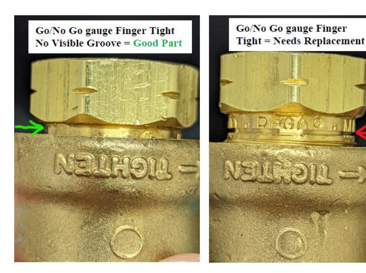
Figure 4 LPG go/no-go gauge POL nut