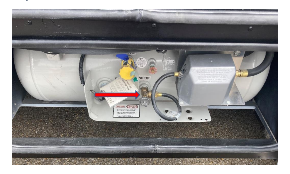
Page 3 of 5