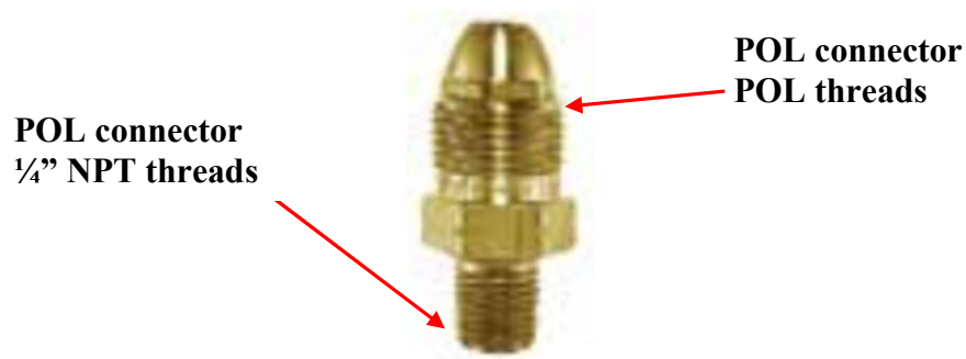
Figure 3: POL Connector for Air Test