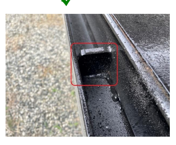
Properly Installed Angle Ramp Track with Caps, Gussets and Welds