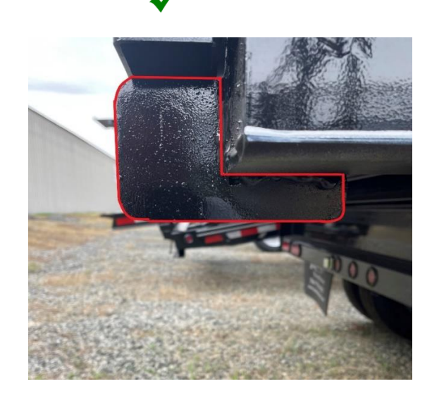
Center Gusset on Angle Ramp Track Installed