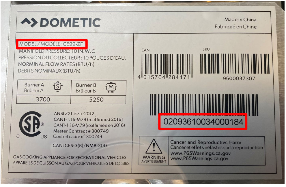
How do I remedy my CE99-ZF or PI8022 cooktop with the Dometic remedy without cost?