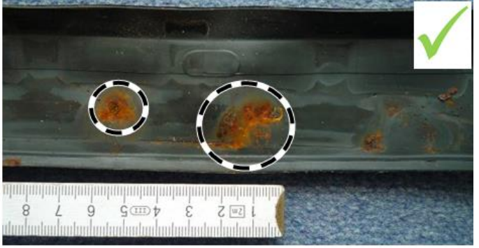
Figure 6 OK