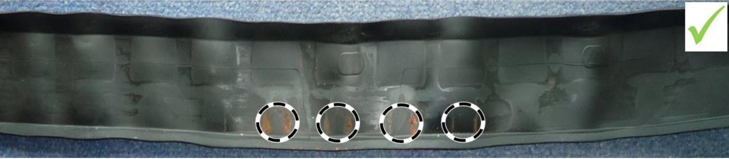
Figure 5 OK

A maximum of one point-shaped corrosion mark with a diameter greater than 15 mm (figures 6 and 7) is permitted.