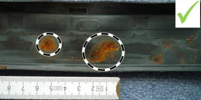
Figure 6 OK Figure 7 OK