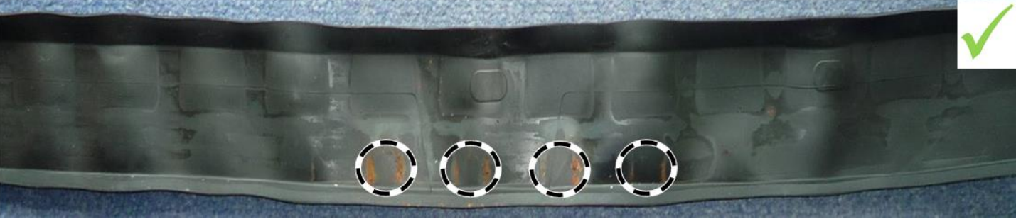
Figure 5 OK

A maximum of one point-shaped corrosion mark with a diameter greater than 15 mm (figures 6 and 7) is permitted.