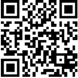
Figure 1 (QR code)

i In the case of a redocumentation with the Mercedes-Benz PartScan app, no additional documentation must be carried out in VeDoc.