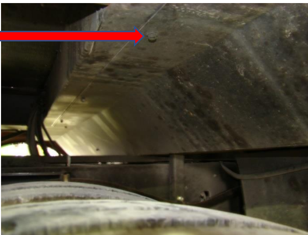
Figure 9: Hex bolts