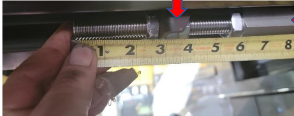
Figure 7: Rod end cylinder mount