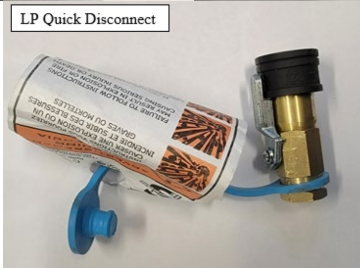
LP Quick Disconnect

You will find our LP Quick Connect threaded in here.