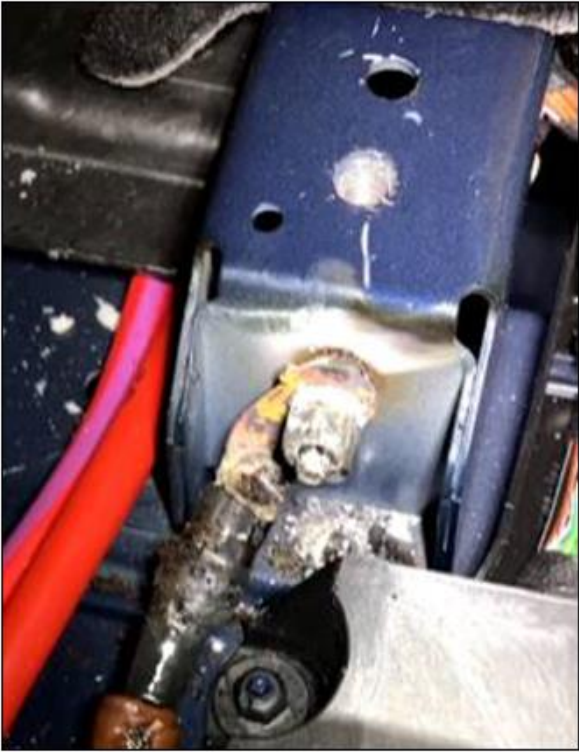
Figure 1 (not OK image)