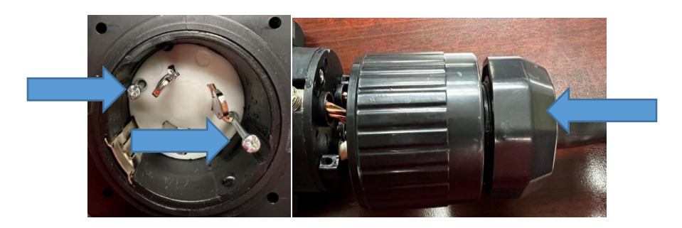
STEP 14. Reinstall the 2 screws to secure housing to inlet and tighten the rear strain relief.

STEP 15. Re-insert the EPICORD 50A inlet back into the wall of the RV and secure using the four screws removed in step 4 above. Please be sure to clear away any old caulking and reseal as per manufacturers standard operating procedure.