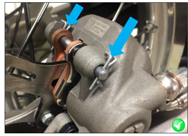
Fig 3. – Correct rear brake mounting