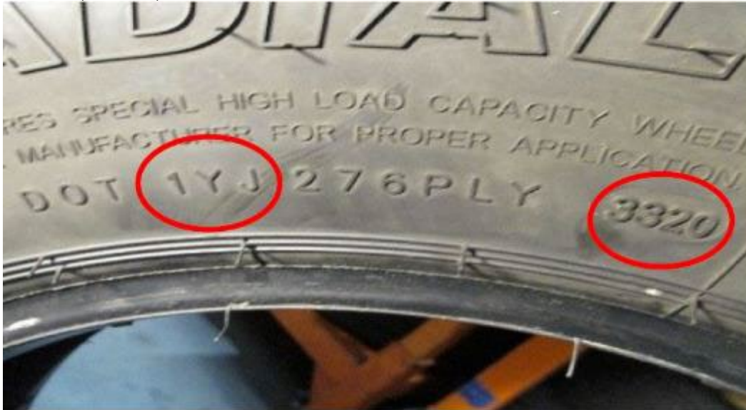
BAD TIRE (FIGURE 2)

STEP 3: PHOTO'S OF ALL TIRES, INCLUDING THE SPARE ARE REQUIRED. THE PHOTO'S ARE REQUIRED TO SHOW THE DOT FACTORY AND DATE CODE (AS SHOWN IN BOTH OF THE "GOOD" AND "BAD" TIRE FIGURES. THIS IS A CONDITION OF PAYMENT.