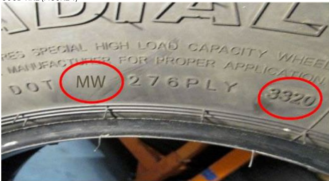
GOOD TIRE (FIGURE 1)

IF THE TIRE HAS A DOT FACTORY CODE OF "1YJ" AND A DATE CODE BETWEEN 2020 THROUGH 4120, THE TIRE IS BAD AND NEEDS TO BE REPLACED SEE FIGURE 2;