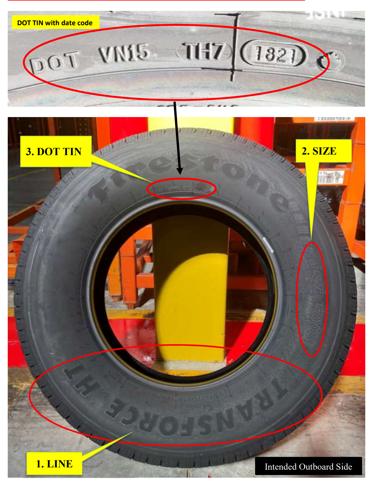
For Firestone Transforce HT LT275/70R18 (Article #s 250109 and 2250109)