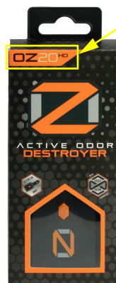
NOT recalled product, DO NOT RETURN