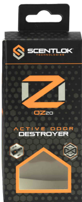
Recalled product. NEEDS TO BE RETURNED