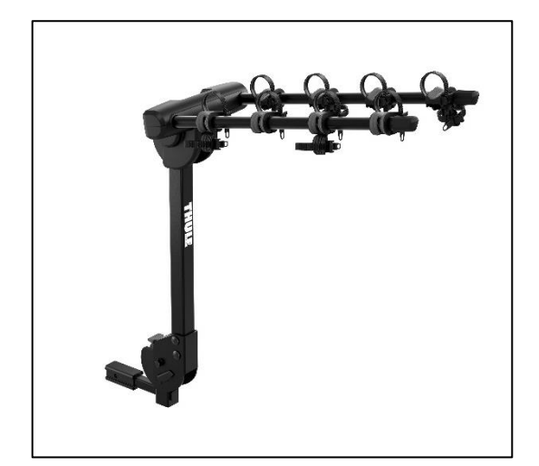
Thule Camber 4 bike 905600